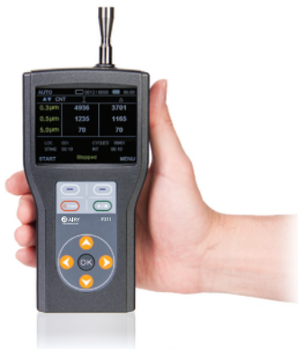
Only 1.26 lbs

The Airy Technology P311 stores 8,000 sample records that can be viewed on the unit or on a computer via USB cable. The P311 complies with ISO 21501-4 and includes a one year warranty. With excellent quality and reliable performance, the Airy Technology P311 is the best priced handheld particle counter in the market.